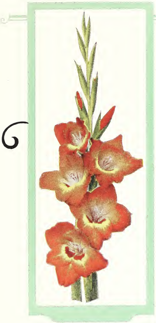
EXHIBIT MAY 1907